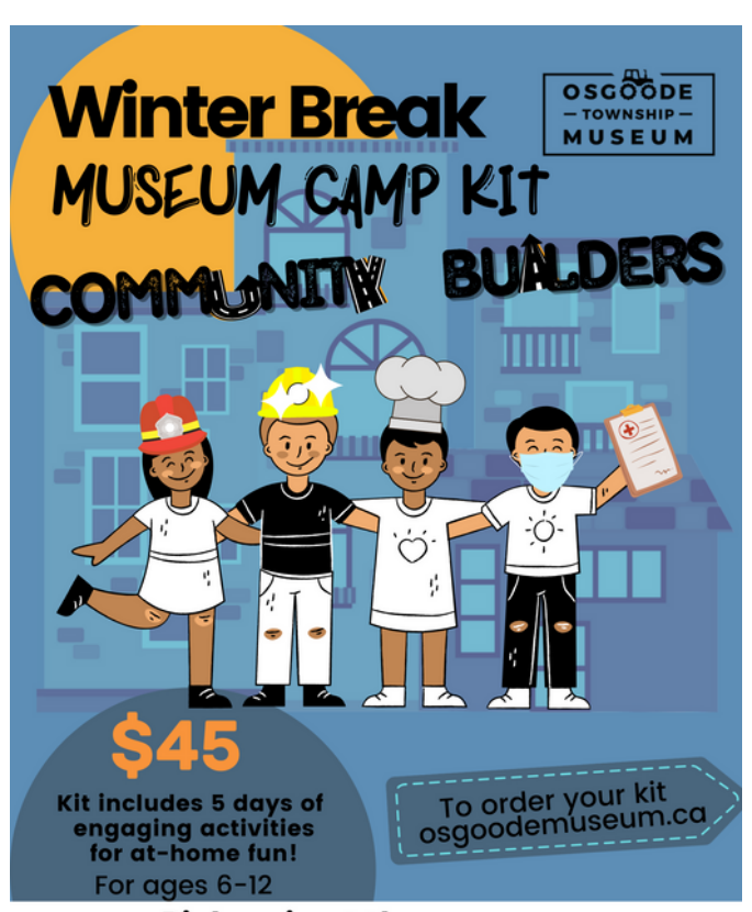
Pickup is at the museum March 12 from 10am-4pm

Full details including how to apply is listed on the museum's website. Deadline to apply is April 8, 2022.